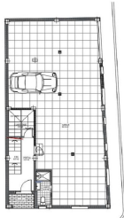
PLANTA BAJA DETERMINACIÓN GENERAL