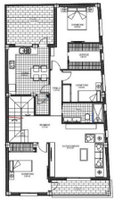
PLANTA ALTA DETERMINACIÓN GENERAL