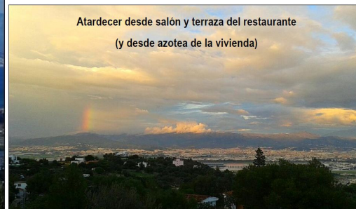
Atardecer desde salón y terraza del restaurante (y desde azotea de la vivienda)