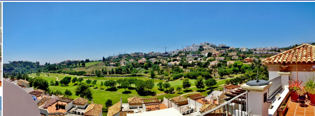
90 sq. mtrs. of rooftop solarium