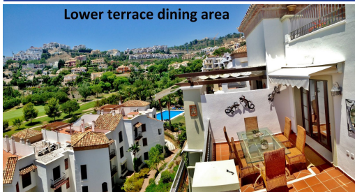
Lower terrace dining area